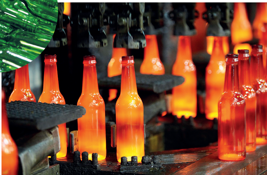
▲ Glass bottles in the process of being manufactured by Owens-Illinois (O-I) at its facility in Brockway, Pennsylvania.