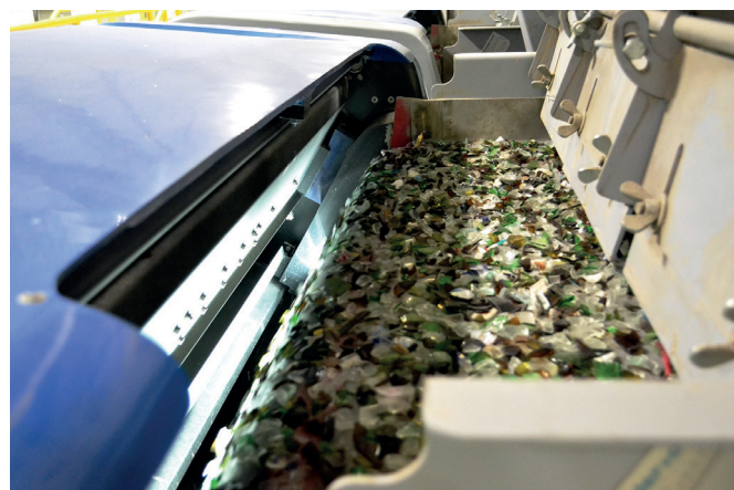
▲ Left and right: Pictured above is the Glass Optical Scanner in operation at the Rumpke Waste & Recycling Facility in Dayton, Ohio. Two Glass Conveyors are seen in the left photograph at the same facility.

of Directors of the Glass Recycling Foundation.