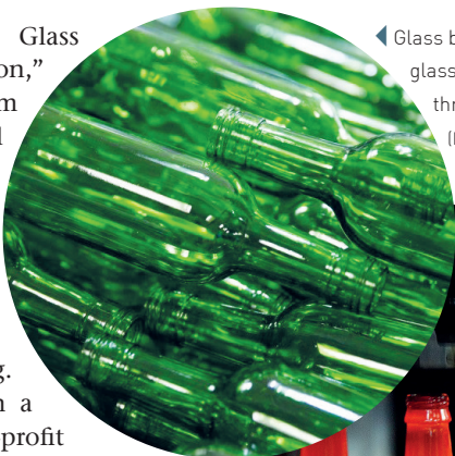
◀ Glass bottles made of recycled glass are utilised by Diageo throughout the world.