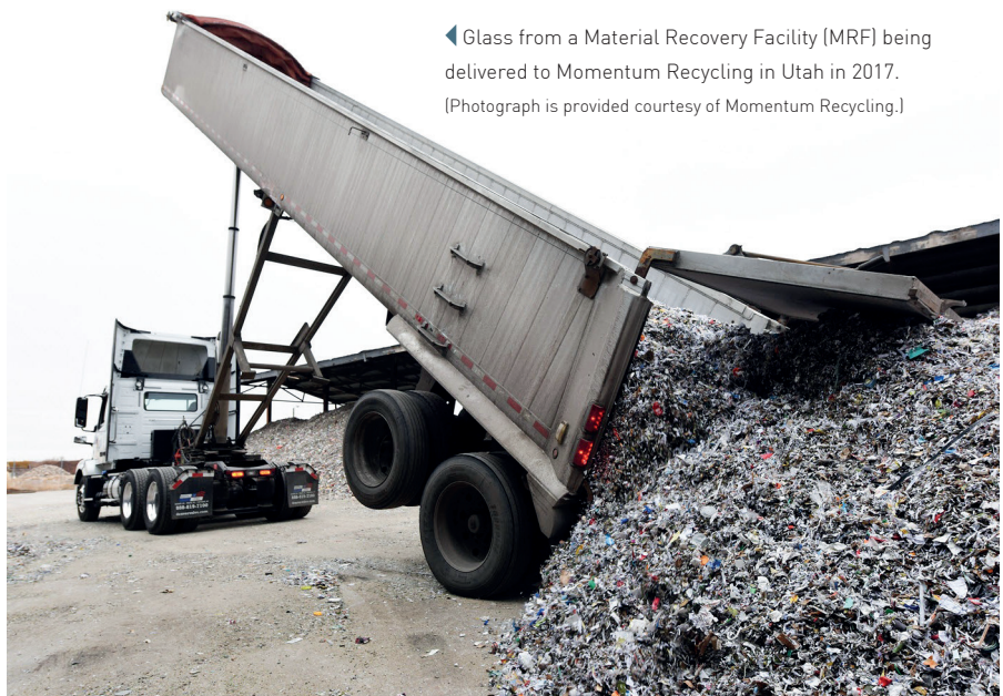
◀ Glass from a Material Recovery Facility (MRF) being delivered to Momentum Recycling in Utah in 2017.

“With the initial funding secured, we anticipate reviewing and providing grants for glass recycling interventions